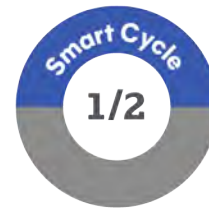
Pre-Transfer Embryology Services