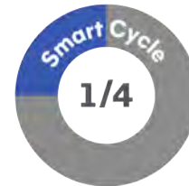
Split Cycle (Egg & Embryo Freezing) When paired with IVF cycle