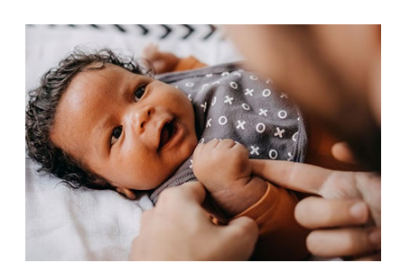
Comprehensive Coverage Fertility treatment and familybuilding services for every unique path to parenthood.